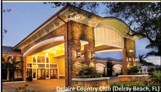
Delaire Country Club (Delray Beach, FL)

Having achieved approvals at over 1,000 clubs across North America, raising over $1.5 billion , McMahon has the survey, planning and presentation experience that makes the difference between success and failure. If your club needs to design, approve & finance a project, You Need to “Plan with McMahon”. Contact us to schedule a First Impressions visit by one of our experienced club planners and financiers.